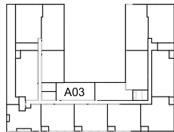
KEY PLAN - A03 - LEVELS 4,5,6

Although all illustrations, specifications and dimensions are believed correct at the time of publication, accuracy cannot be guaranteed. The right is reserved to make changes without notice or obligation. Windows, doors and ceilings may vary on the options and elevations selected. Optional items indicated are available at additional cost. This brochure is for illustrative purposes only and not part of a legal contract. See Sales Representative for details. Coldwell Banker has Ownership of all Artwork including original digital files as well as preliminary designs. Artwork cannot be used without written permission of Coldwell Banker.