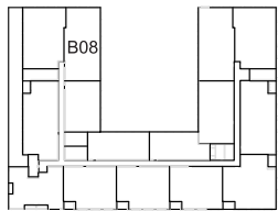
KEY PLAN - B08 - LEVELS 4,5