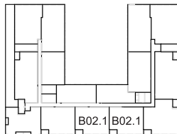
KEY PLAN - B02.1 - LEVELS 3,4,5

Luxury finishes Open floor plan 10' ceilings Secure private garage Pool deck Fitness center Residence lounge Rooftop terrace