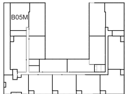
KEY PLAN - B05M-312 - LEVEL 3