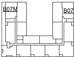
KEY PLAN - B07 & B07M - LEVEL 3, 4 & 5