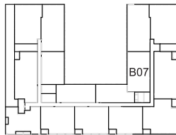
KEY PLAN - B07 - LEVELS 3,4,5

Luxury finishes Open floor plan 10' ceilings Secure private garage Pool deck Fitness center Residence lounge Rooftop terrace