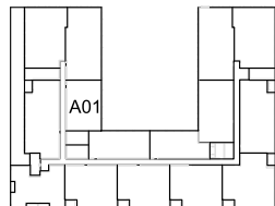
KEY PLAN - A01 - LEVELS 3,4,5