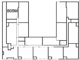
KEY PLAN - B05M - LEVELS 4,5